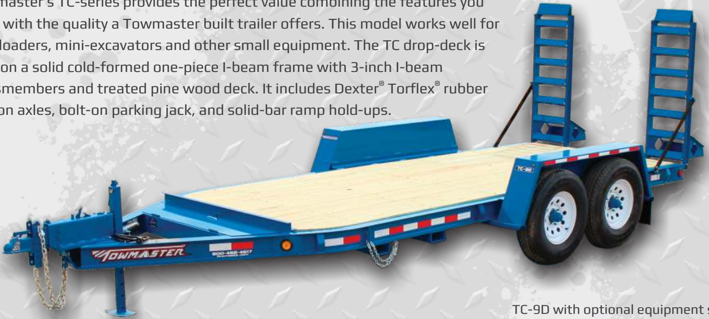
TC-9D with optional equipment shown

Towmaster's TC-series provides the perfect value combining the features you need with the quality a Towmaster built trailer offers. This model works well for skid-loaders, mini-excavators and other small equipment. The TC drop-deck is built on a solid cold-formed one-piece I-beam frame with 3-inch I-beam crossmembers and treated pine wood deck. It includes Dexter® Torflex® rubber torsion axles, bolt-on parking jack, and solid-bar ramp hold-ups.