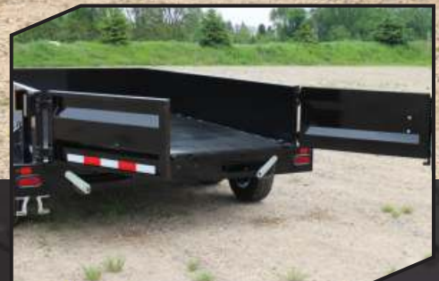
Barn-door style rear gate can be attached in place with a cable to keep them out of the way when lifting dump bed.