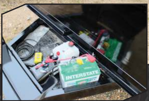
Built-in storage box houses hydraulic system with room for chains, straps or tools.