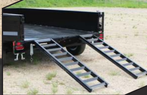
Ladder-style ramps are standard and are stored under the bed.