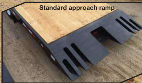
Standard approach ramp