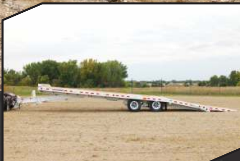
Low incline makes loading and unloading small-wheeled equipment easier.