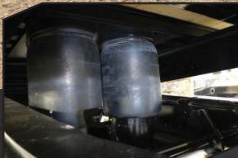
Dual air-bag design uses air from the tow vehicle's system.