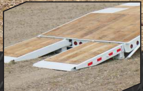
Optional 6-foot air ramps provide an easy approach angle.