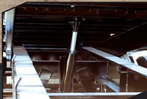
Cushion cylinder controls the deck from slamming when loading or unloading equipment.