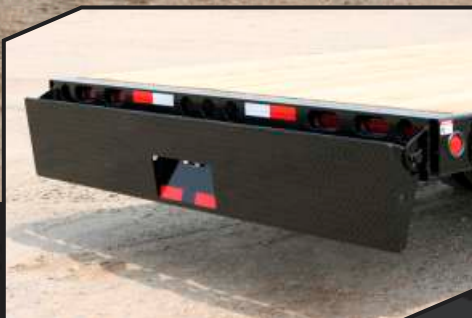
Patented automatic kick-out ramp doubles as under-ride protection.