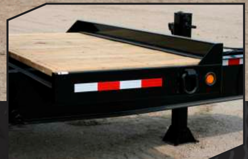
Standard 4-foot stationary deck gives room for longer equipment and makes towing easier.