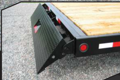
Patented automatic kick-out ramp doubles as under-ride protection.