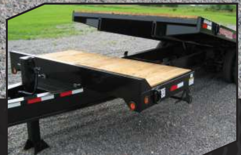
Standard 4-foot stationary deck gives room for longer equipment and makes towing easier.