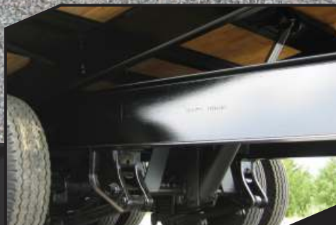
Cushion cylinder controls the deck from slamming when loading or unloading equipment. Optional Hutchens 9700 suspension shown.