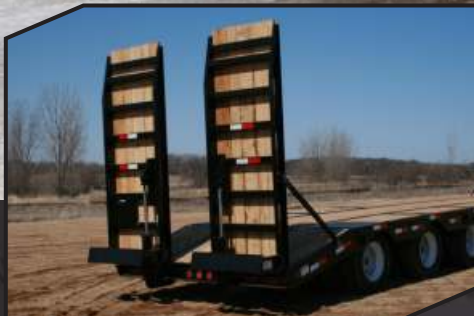
Solid-bar ramp holdups.