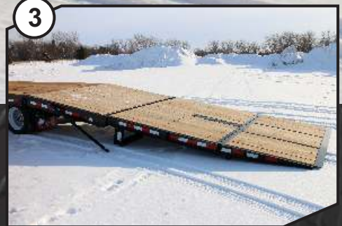
3 Finish lowering ramp for a low loading angle of approximately 9°.