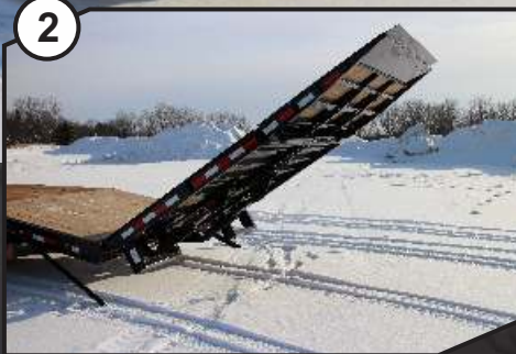
2 Raise tail section...