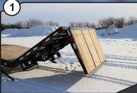
1 Simple operation. Lower ramp part way...