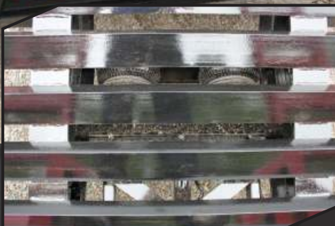
Air actuators located under beavertail.