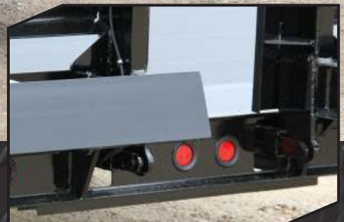
Ramp control levers through tailboard.