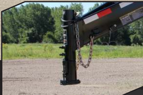
Standard ball hitch.