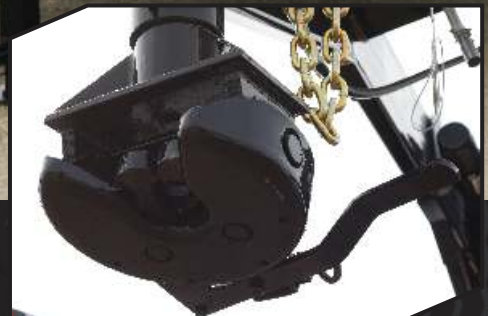
Inverted Fifth-Wheel hitch option.