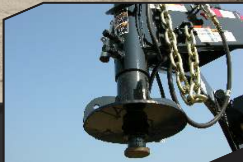
Fifth-Wheel hitch option.