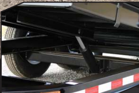
Cushion cylinder controls the deck when loading or unloading equipment.