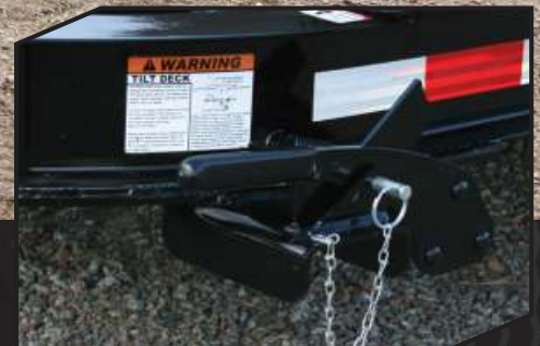
Single deck latch lever with dual latch security is easy to operate.