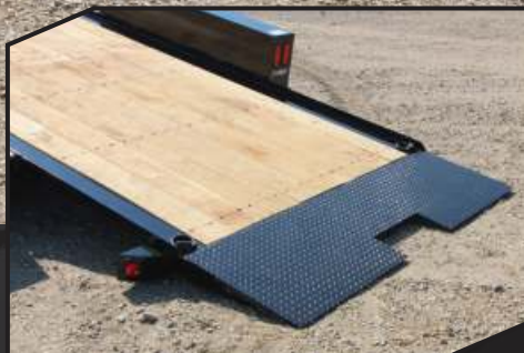
Long approach ramp allows easy equipment loading and unloading.