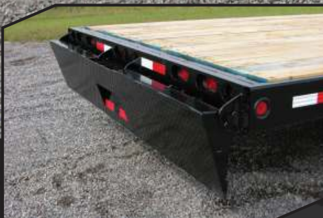
Patented automatic kick-out ramp doubles as under-ride protection.