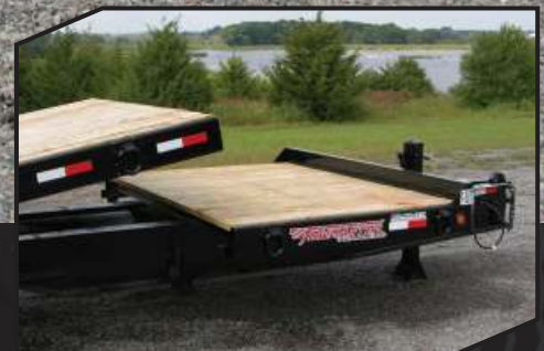
Stationary deck is standard on all deck-over tilt models.