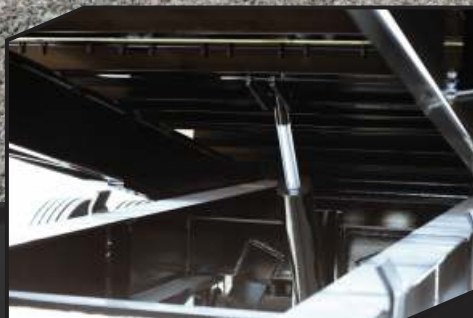
Cushion cylinder controls the deck from slamming when loading or unloading equipment.