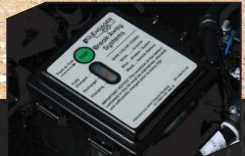
Sealed battery break-away system charges while plugged into the tow vehicle and can be checked at the press of a button.