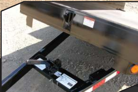
Positive locking (over-center) latch system keeps deck secured to the frame.