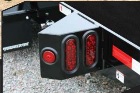
Grommet mounted LED lights are standard.