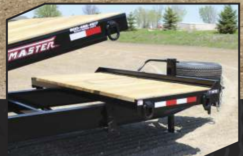
Optional 4-foot stationary deck gives room for longer equipment and makes towing easier.