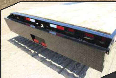
Patented automatic kick-out ramp doubles as under-ride protection.