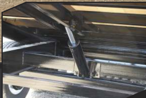
Cushion cylinder controls the deck from slamming when loading or unloading equipment.