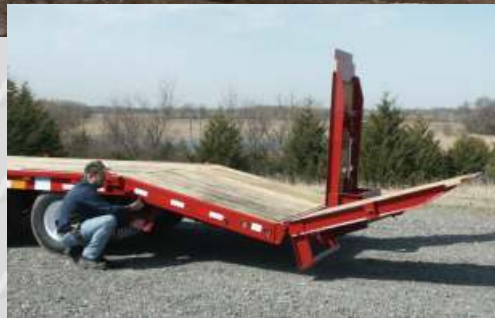
Easy to operate controls.