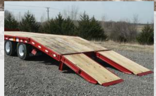
Wood-topped or steel cleat.