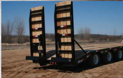
Solid-bar ramp holdups.