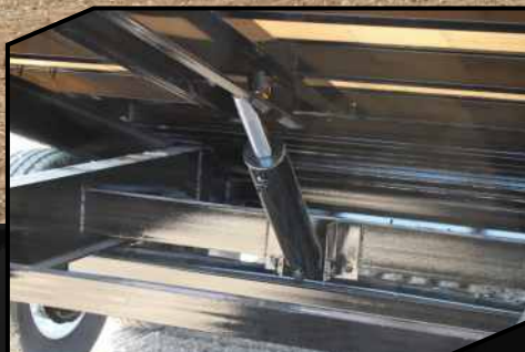
Cushion cylinder controls the deck from slamming when loading or unloading equipment.