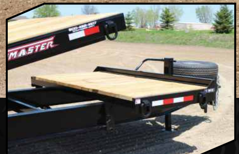
Optional 4-foot stationary deck gives room for longer equipment and makes towing easier.