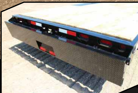
Patented automatic kick-out ramp doubles as under-ride protection.