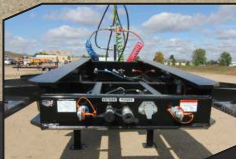
Heavy-duty main frame with conveniently located air and electrical connectors.