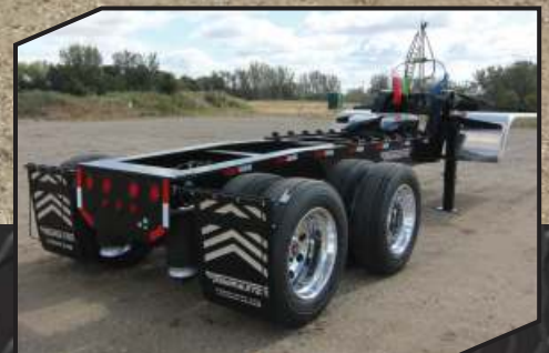
Air ride suspension.