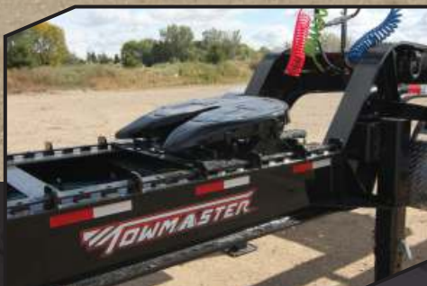
41" sliding adjustable fifth wheel.