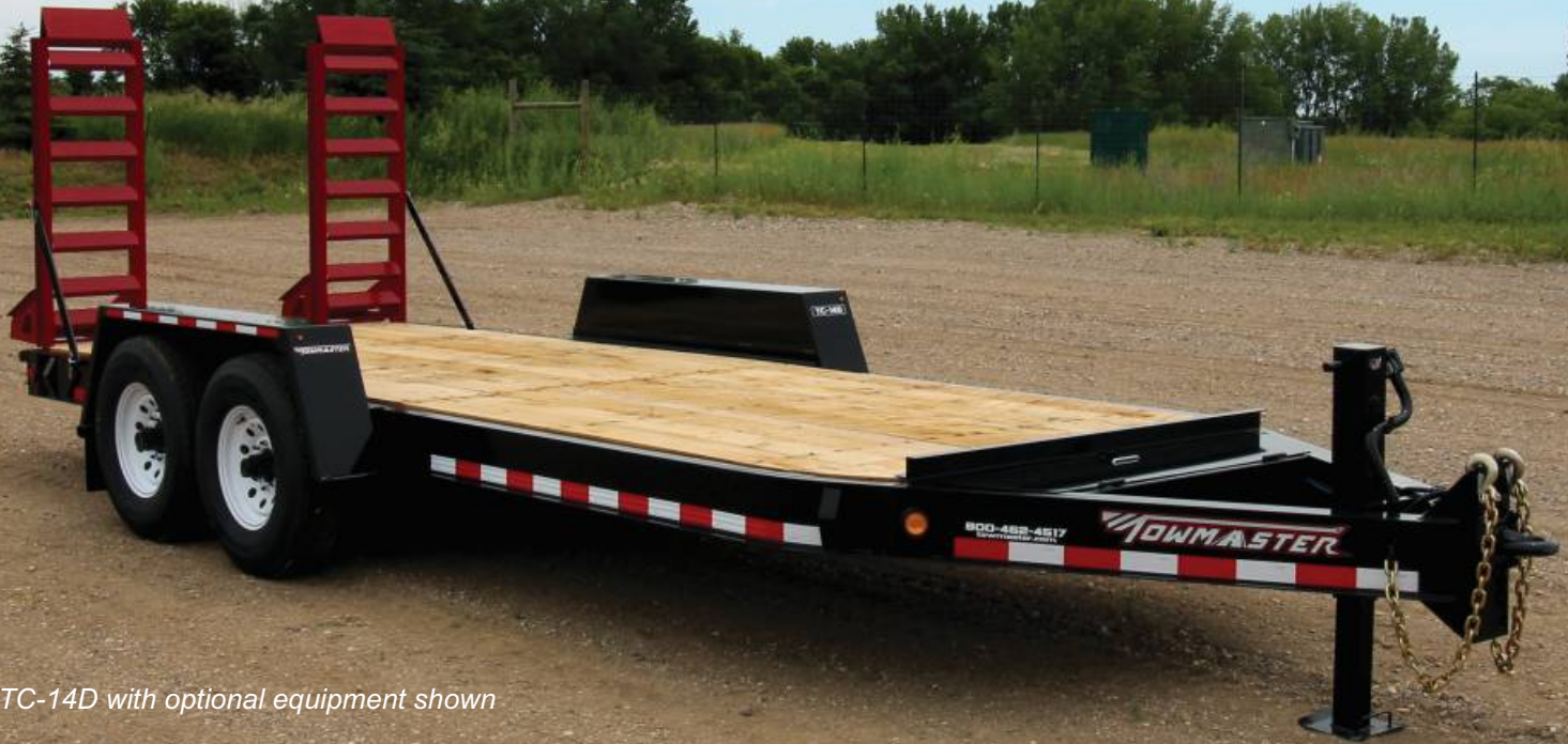
TC-14D with optional equipment shown