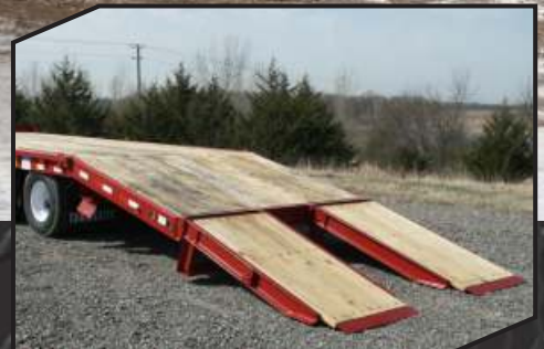
Wood-topped or steel cleat.