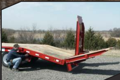
Easy to operate controls.