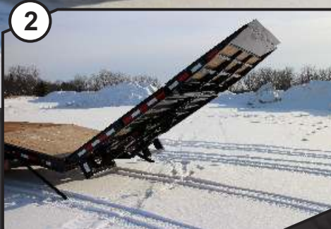
2 Raise tail section...