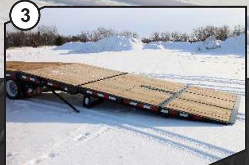
3 Finish lowering ramp for a low loading angle of approximately 9°.