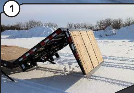
1 Simple operation. Lower ramp part way...