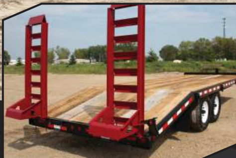
Wood topped beavertail and Auto-Latch® ramp hold-ups.