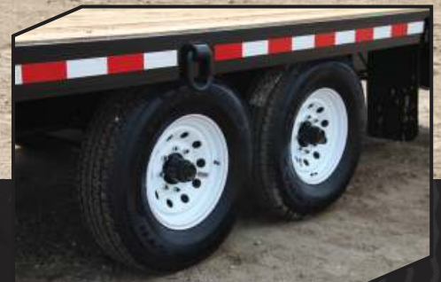
Rubber torsion axles provide a smooth ride.