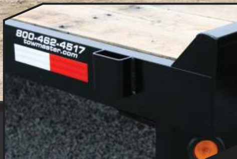
Stake pockets are standard on this model.