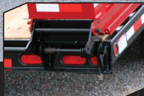
One-way spring-assist ramps and grommet mounted LED lights.