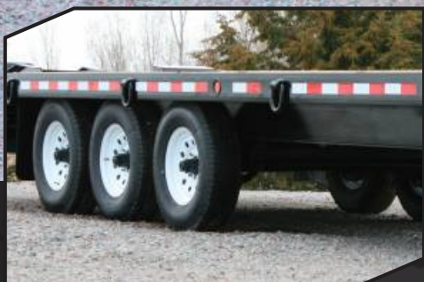
Single-wheel tri-axle. 6K axles with spring-ride suspension.