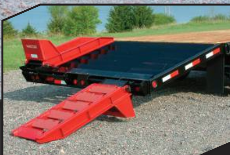
Angle-iron beavertail and ramps provide excellent traction for loading and unloading.