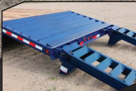
Angle-iron beavertail and ramps provide excellent traction for loading and unloading.