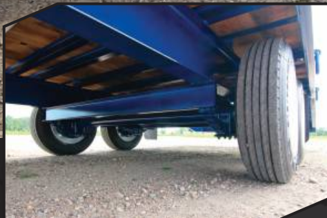
Single-wheel tandem axle. 8K axles with spring-ride suspension.