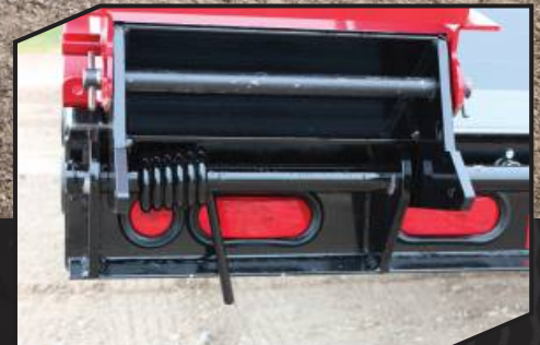
One-way spring-assist ramps and grommet mounted LED lights.