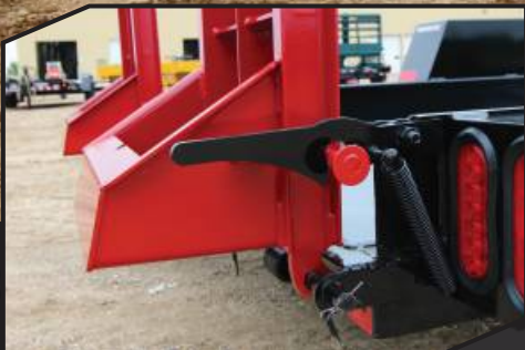
Patented Auto-Latch® ramp hold-ups and LED lights are standard.