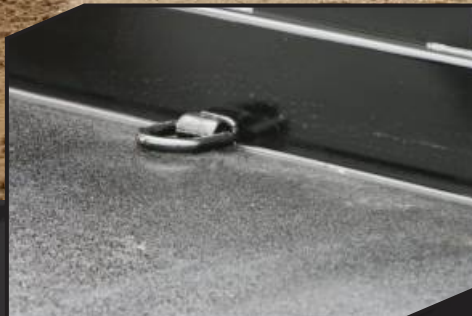
An optional steel deck with traction aid is available.