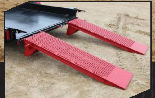
"SL" ramp option gives a lower load angle for special equipment like scissor lifts and other small-wheeled vehicles.