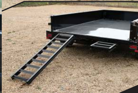
Optional ladder-style ramps for loading equipment, stored above fender.