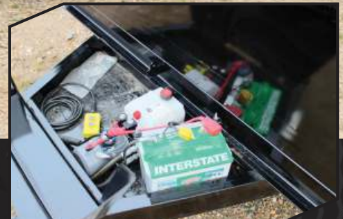
Built-in storage box houses hydraulic system with room for chains, straps or tools.