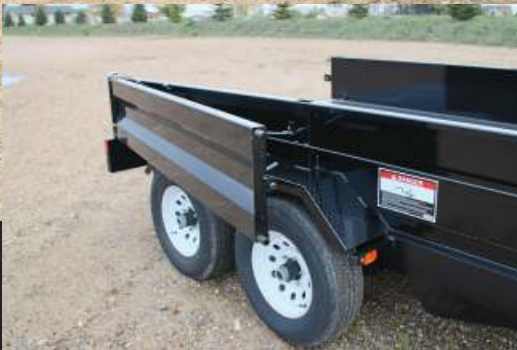
Tri-swing rear gate opens to the side, down from the top, or swings open from the bottom.