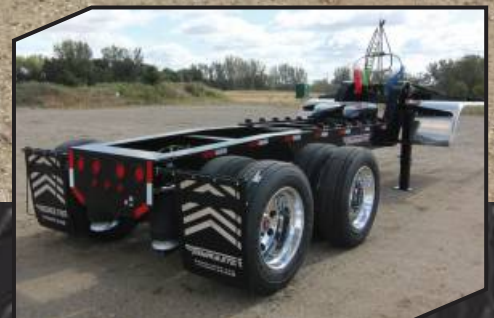
Air ride suspension.