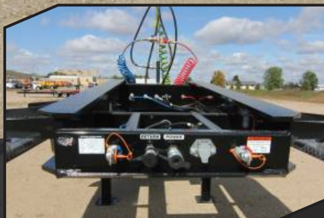
Heavy-duty main frame with conveniently located air and electrical connectors.