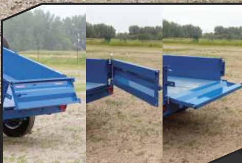
Tri-swing rear gate opens to the side, down from the top, or swings open from the bottom.