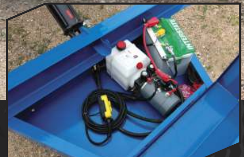
Built-in storage box houses hydraulic system with room for chains, straps or tools.