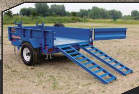
Optional ladder-style ramps for loading equipment, stored above fender.