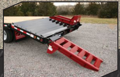
Two-way spring assist ramps allow you to easily lift ramps off deck and also off the ground. Grommet mounted LED lights are standard.