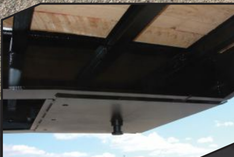
S.A.E. King Pin with smooth approach plate for easy hook-up.