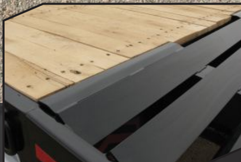
Wood protectors are standard on Towmaster T-series trailers and protect the end of the deck boards.