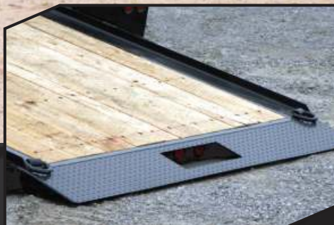
Knife edge approach ramp allows easy equipment loading and unloading.