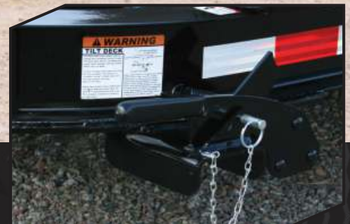
Single deck latch lever with dual latch securement is easy to operate.