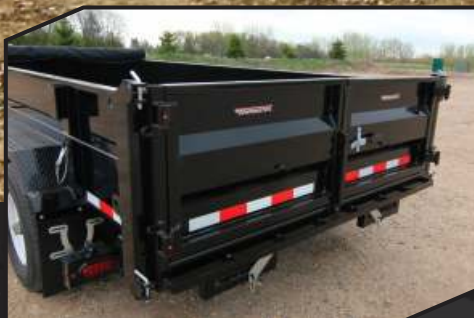
Three-way double doors open to the side, down from the top, or swing open from the bottom.