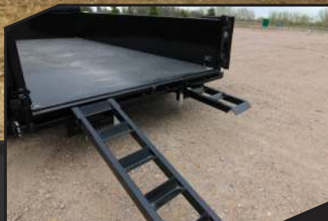
Ladder-style ramps for loading equipment, stored under dump body.