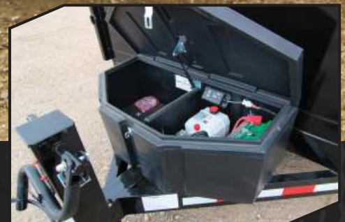
Poly storage box houses hydraulic system with room for chains, straps or tools.