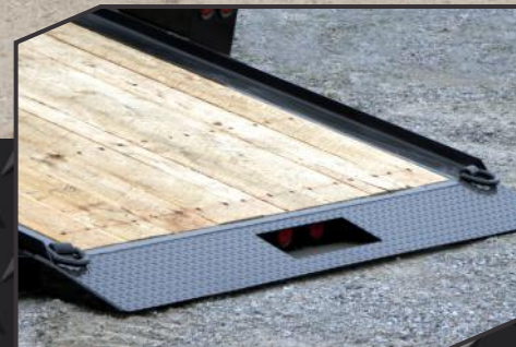
Knife edge approach ramp allows easy equipment loading and unloading.