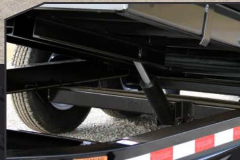
Cushion cylinder controls the deck from slamming when loading or unloading equipment.