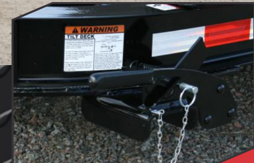
Single deck latch lever with dual latch security is easy to operate.