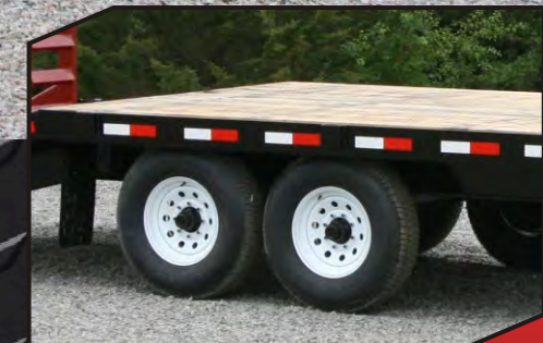
Rubber torsion axles provide a smooth ride.