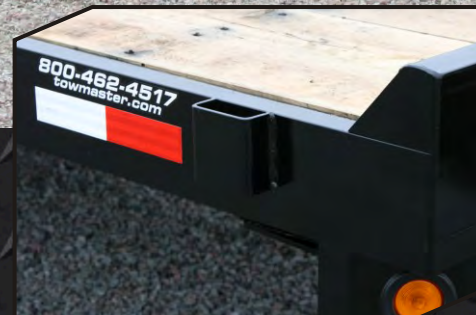
Stake pockets are standard on this model.