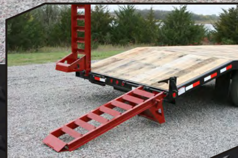
Wood topped beavertail and Auto-Latch ramp hold-ups.