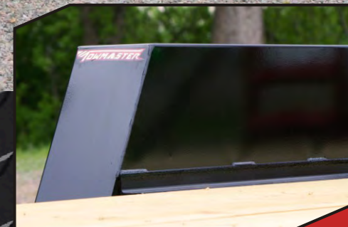
Heavy-duty one-piece formed fender with backing plate keeps tire debris off equipment.