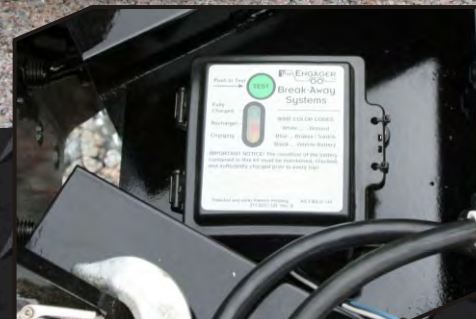
Sealed battery break-away system charges while plugged into the tow vehicle and can be checked at the press of a button.