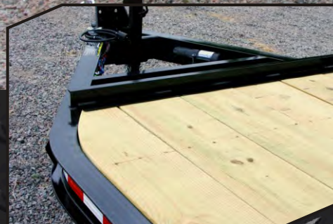
Formed frame and tongue provide a strong and integral structure for the trailer.