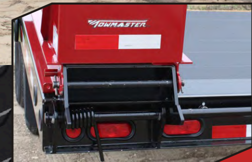
Off-the-ground spring assist ramps for easy ramp lifting. Grommet mounted incandescent lights are standard.