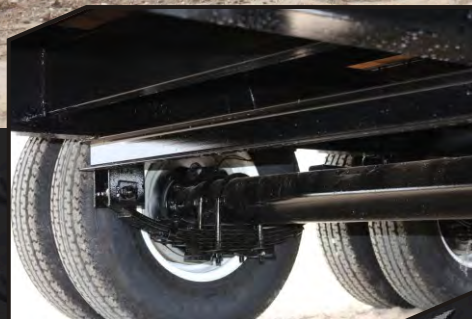
Dexter slipper-spring suspension provides the capacity you need at a budget price.