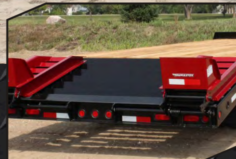
Self-cleaning angle iron beavertail also provides positive traction when loading equipment.