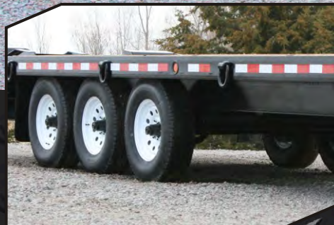
Single-wheel tri-axle. 6K Dexter Torflex axles with rubber-ride suspension.