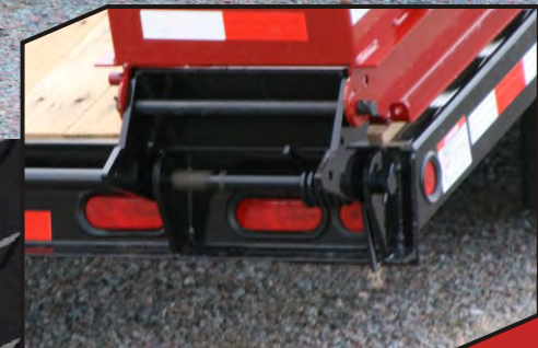
One-way spring-assist ramps and grommet mounted incandescent lights.