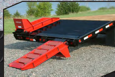
Angle-iron beavertail and ramps provide excellent traction for loading and unloading.