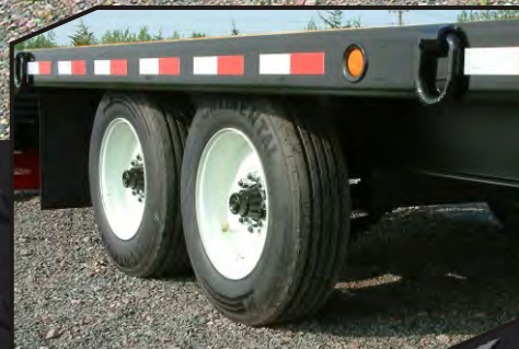
Single-wheel tandem axle. 8K Dexter Torflex axles with rubber-ride suspension.