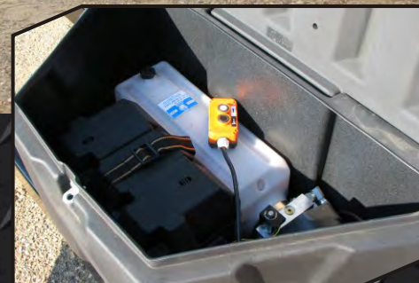
Dual-door tailgate and grommet mounted LED lights.