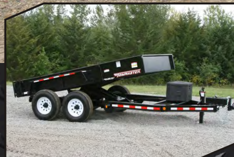
T-HD9L and T-HD10L feature 13-inch dump body, no ramp storage, and no pallet fork holders.