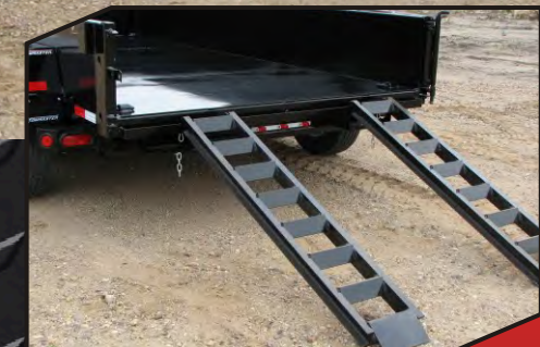
Poly box houses self-contained hydraulic system. Can be locked.