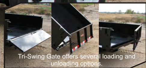
Tri-Swing Gate offers several loading and unloading options.