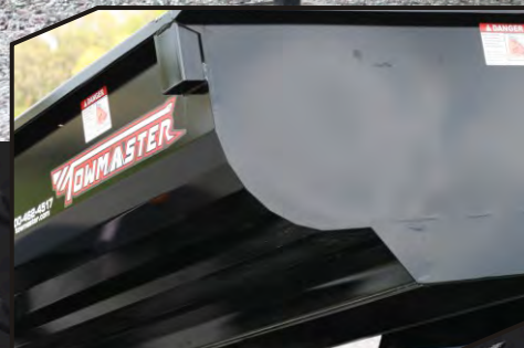
Towmaster exclusive radius box adds rigidity and reduces overall weight.