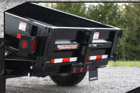
Dual-door tailgate and grommet mounted LED lights.