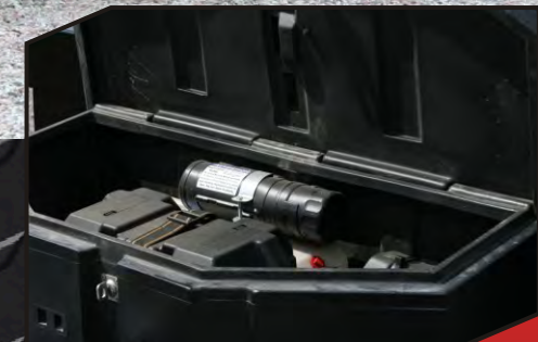
Poly box houses self-contained hydraulic system. Can be locked.