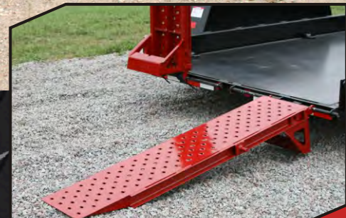
"SL" ramp option gives a lower load angle for special equipment like scissor lifts and other small-wheeled vehicles.