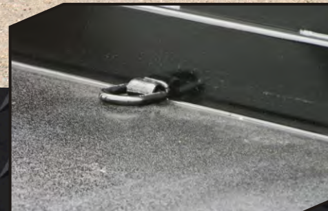
An optional steel deck with traction aid is available.