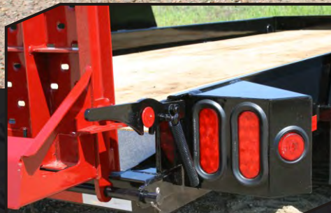
Patented Auto-Latch® ramp hold-ups and LED lights are standard.