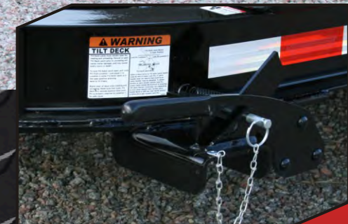
Single deck latch lever with dual latch security is easy to operate.