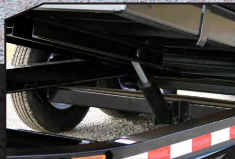
Cushion cylinder controls the deck from slamming when loading or unloading equipment.