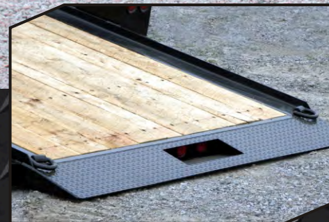
Knife edge approach ramp allows easy equipment loading and unloading.