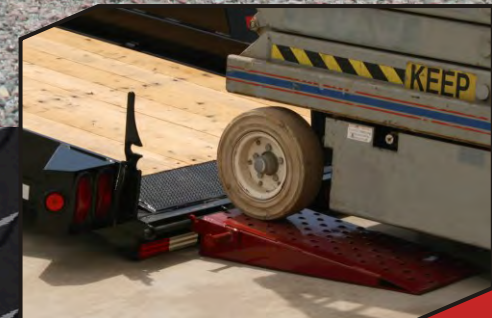
The "SL" (Scissor Lift) option includes ramps to lower the loading incline.