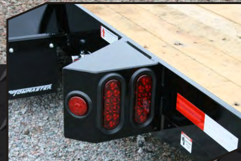
Grommet mounted LED lights are standard.