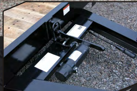
Positive locking (over-center) latch system keeps deck secured to the frame.