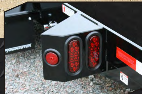
Grommet mounted LED lights are standard.