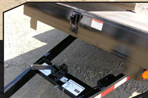
Positive locking (over-center) latch system keeps deck secured to the frame.