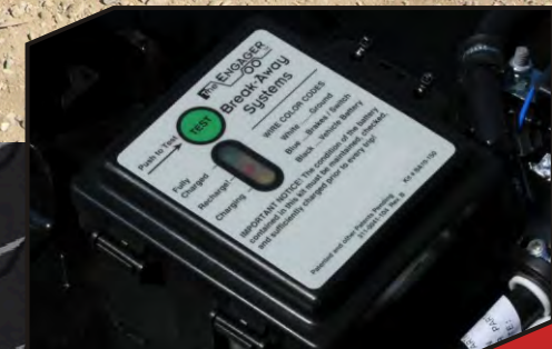
Sealed battery break-away system charges while plugged into the tow vehicle and can be checked at the press of a button.